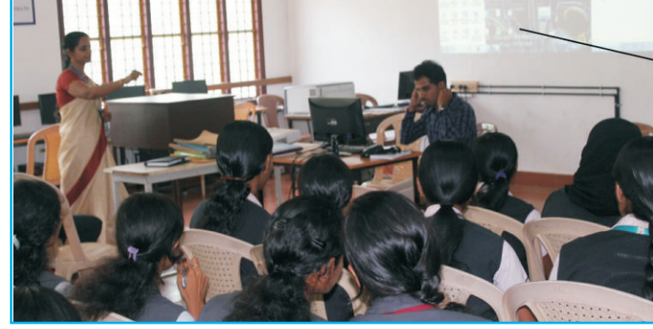
Two day training program on "Geometric Design of roads using PlannalSoftware" was conducted on 12th and 13thof March 2018.